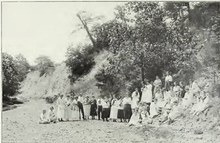
A GEOGRAPHY CLASS IN THE PRESENCE OF "THE WORLD IN THE MAKING"